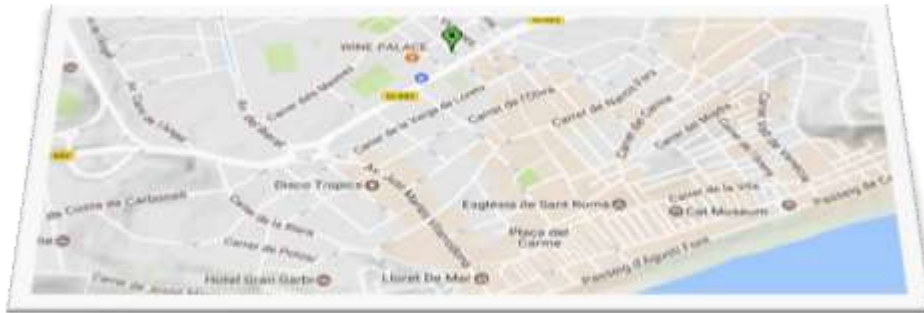
Platja de Lloret, Lloret de Mar (Costa Brava)

Piscina de Lloret Av. del Rieral, 22 17310 Lloret de Mar Girona T: (+34) 972 364 384 piscina@lloret.cat www.piscinalloret.cat www.lloret.cat