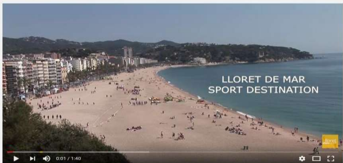
Lloret de Mar Sport Destination